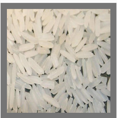
White Boiled Non Basmati Long Grain Rice