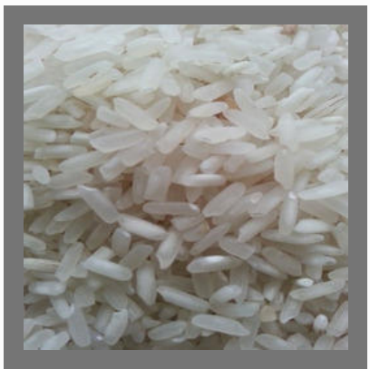
Raw Non Basmati IR64 Rice