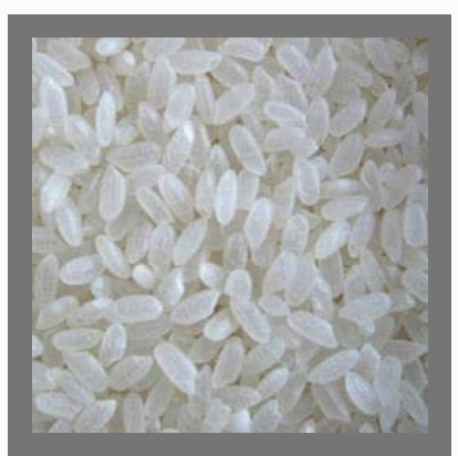
Raw Non Basmati Sona Masuri Rice