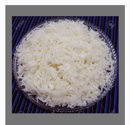
Plain Boiled Rice