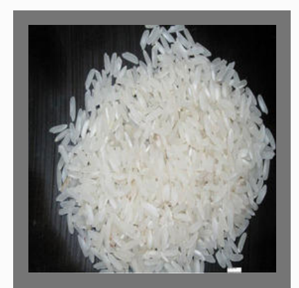
Raw Non Basmati Long Grain Rice