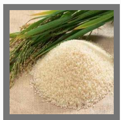
Jeerasir Non Basmati Rice