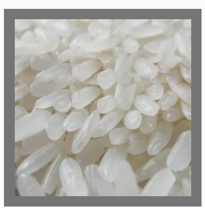
White Boiled IR 8 Non Basmati Rice