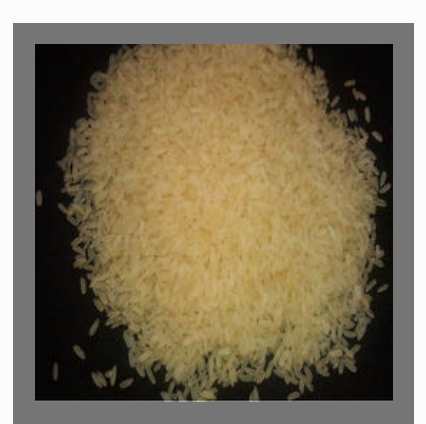
Parboiled Non Basmati Rice IR