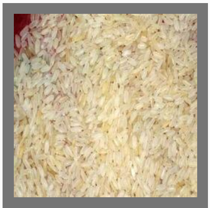
Parboiled Non Basmati GR 11 Rice