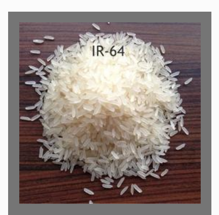
IR 64 Rice