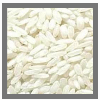
Raw Non Basmati Parmal Rice