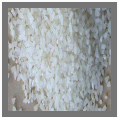
White Boiled Broken Rice