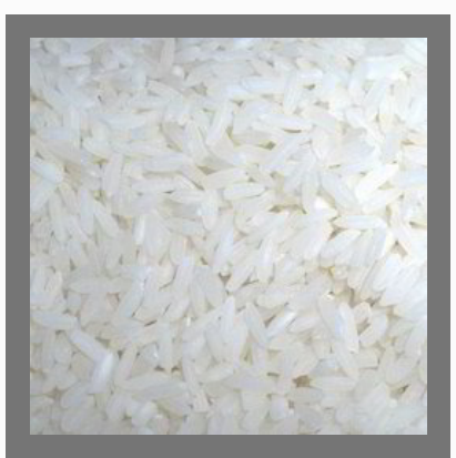
IR 36 Non Basmati Rice