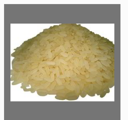
Parboiled Non Basmati Rice IR 8