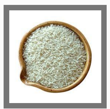
Raw Non Basmati Kolam Rice