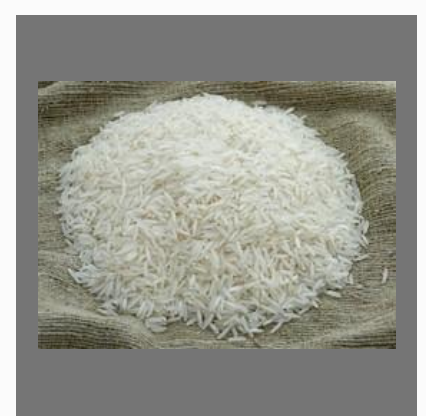
IR8 Non Basmati Rice