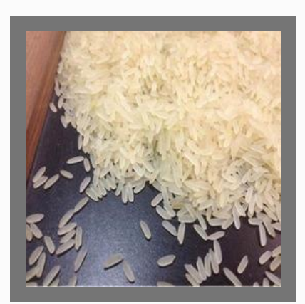
Parboiled Non Basmati Parmal Rice