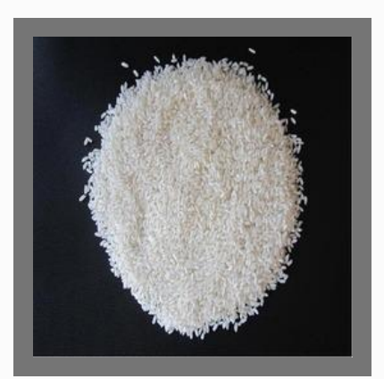
Raw IR8 Non Basmati Rice