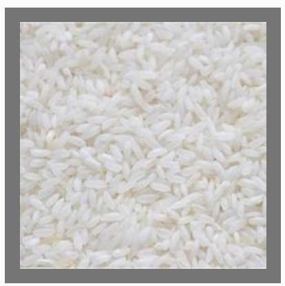
Raw Non Basmati Ponni Rice