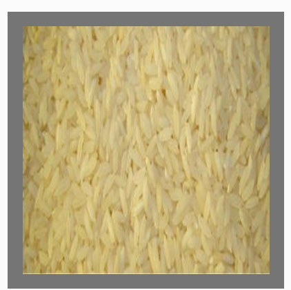
Parboiled Non Basmati Sona Masuri Rice