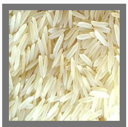
Parboiled Non Basmati Long Grain Rice